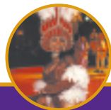
CLIENT ENTERTAINING AND HOSPITALITY