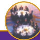
CONFERENCES AND MEETINGS