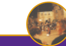
CORPORATE AWAY DAYS AND PARTIES