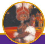
CLIENT ENTERTAINING AND HOSPITALITY