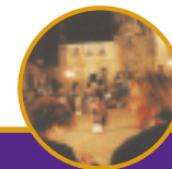
CORPORATE AWAY DAYS AND PARTIES