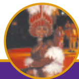
CLIENT ENTERTAINING AND HOSPITALITY