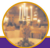
EVENT THEMING AND DECOR