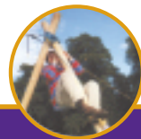
TEAMBUILDING AND INCENTIVES