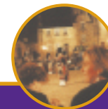
CORPORATE AWAY DAYS AND PARTIES