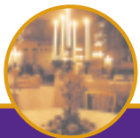
EVENT THEMING AND DECOR

We bring a fresh originality to everything that we do, no matter how routine or familiar it may seem. Our project team will be on hand throughout to ensure the success of all aspects of your event. And our expertise doesn't end with the conference – we can create all manner of exciting social events and activities to bring out the “lighter” side of the conference. Theming and entertainment for the conference dinner is another of our specialities – everything from traditional to avant-garde!