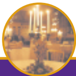
EVENT THEMING AND DECOR